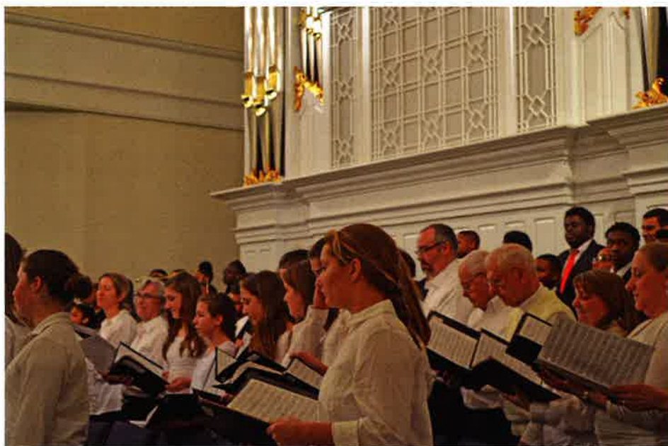
Choirs for all ages