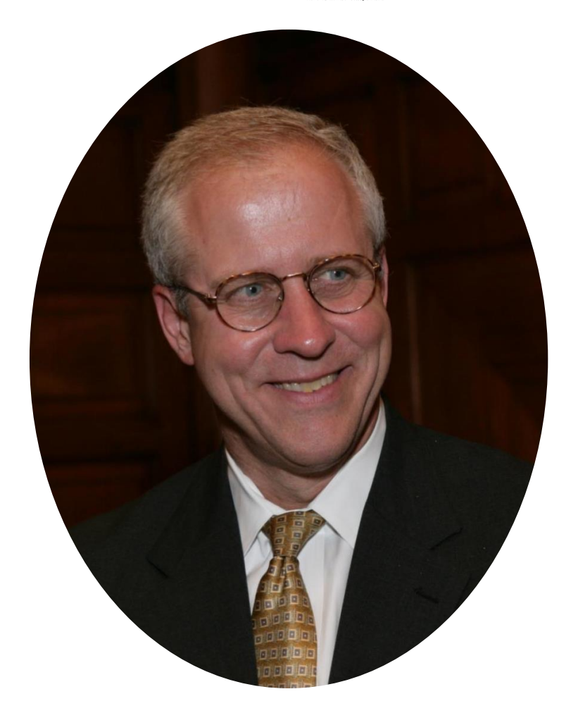
A Service of Celebration and Thanksgiving For the Life of